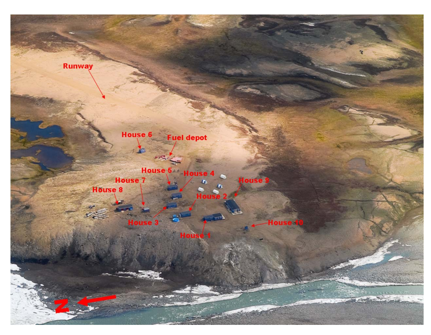
Figure 2 Aerial view of Zackenberg Research Station, Northeast Greenland, 2009. House no. 1: Kitchen, food store and dining room. House no. 2: Wet laboratory. House no. 3: Dry laboratory. House no. 4: Office and accommodations for Basis programmes. House no. 5: Office with means of communication (VHF, HF and satellite phones) and accommodations for logistics. House no. 6: Accommodations for logistics. House no. 7: Workshop for logistics. House no. 8: Generator and workshop. House no. 9: Living room, accommodations, sauna and toilets. House no. 10: Extra toilets. The runway is 450 metres long.

The daily fee for staying at Zackenberg Research Station and its branch facility at Daneborg (including full board and use of all facilities for scientists) are given in the price list. Non-scientists are generally not allowed access to Zackenberg Research Station and its branch facility at Daneborg. However, journalists and artists might be allowed access to the station but only if the planned activities does not conflict with the research activities at the station. Accommodation based on own tent and/or food is not allowed unless special arrangements have been made with Greenland Ecosystem Monitoring (GEM) Coordination Group. Please notice that prices for transport to/from Zackenberg /Daneborg and prices for staying at Zackenberg/Daneborg are differentiated depending on whether you are a scientist or a non-scientist.