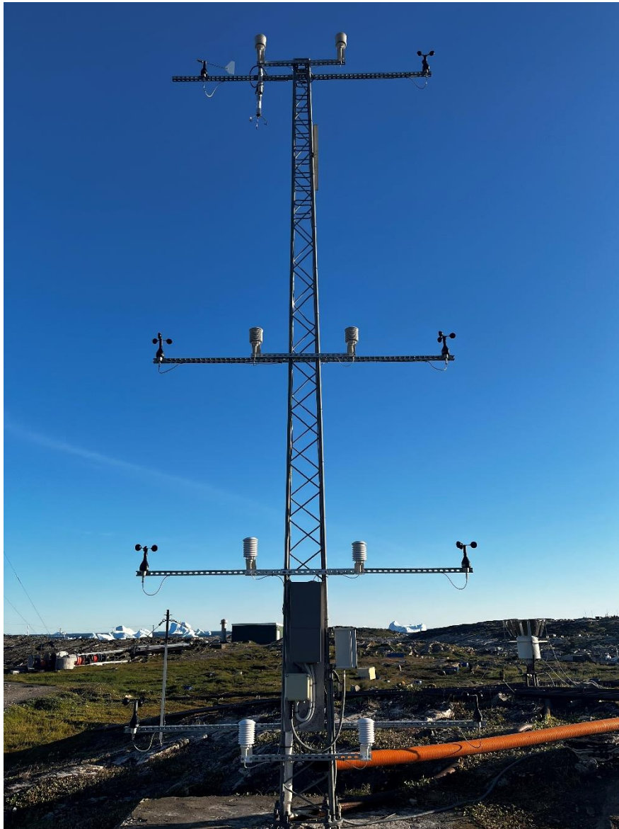
Main mast of the Teleø climate station, with two identical sensors mounted at each level.

Arno C. Hammann Asiaq – Greenland Survey Qatserisut 8 3900 Nuuk E-mail: ach@asiaq.gl