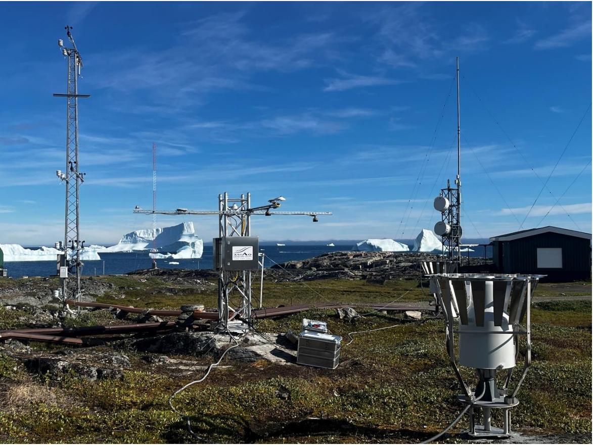
Main and secondary masts and one of the two rain gauges at Teleø.